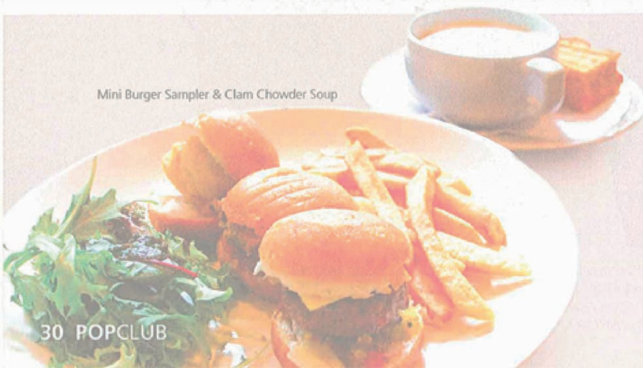
Mini Burger Sampler & Clam Chowder Soup