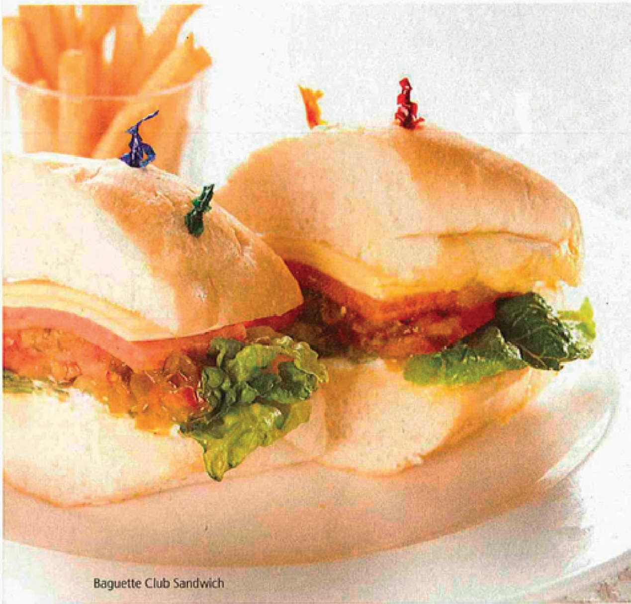
Baguette Club Sandwich

To those with artistic temperament, Hotel Re! is the latest hotspot imbued with retro-turned-hippy chic vibes. Situated at the base of Pearl's Hill, it evokes a modern allure with its bold popsicle palette coupled with psychedelic furnishings. With a new menu out in July, we lapped up the chef's recommendations at Re!Fill, and went gaga over the Baguette Club Sandwich (chef's recommendation). Beneath the golden toasted crust, there are four layers of fillings: cheese, tomatoes, lettuce and ham, and the juicy savoury taste is simply to die for! The sheer sight of the tangy Tuna Croissant also had us going ooh-la-la! The slit pocket of the warm toasty croissant is packed with generous fillings – chunks of tuna with celery, gherkin, tomatoes and onions tossed in guacamole dressing. Fresh and moist, it sets our taste-buds into overdrive.